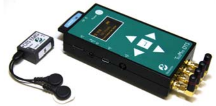
Belt Receiver/ Retransmitter